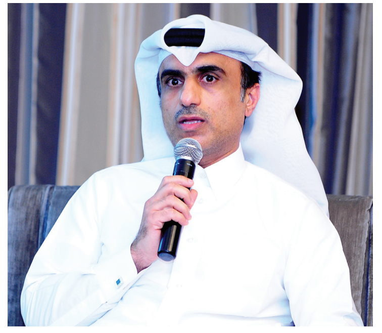
"We have been working with our partner - ILO - to make the procedures easier for the workers to move from one employer to anther and to change their employment"

Al-Obaidly said: "We have recently implemented new rules just to abolish kafala system. We